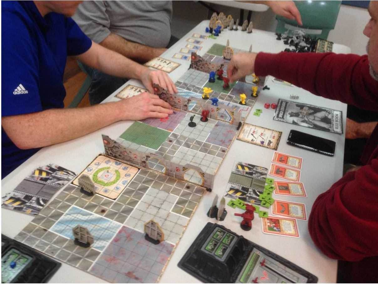
The tough and resourceful Imperial space marines continue their 'sweep & clear' mission through the alien-infested space hulk: