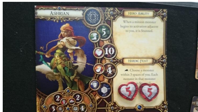
Example Descent: JITD Character

Last Night on Earth (the Zombie survival game) which became the unsurvivable zombie game because the game host (yours truly) utterly failed to include any of the board components or any of the hero-cards which might have allowed the heroes ( humans ) to fuel-up the pick-up truck and escape the town! Zombies: 1; Humans: Nil Host: outta gas..!